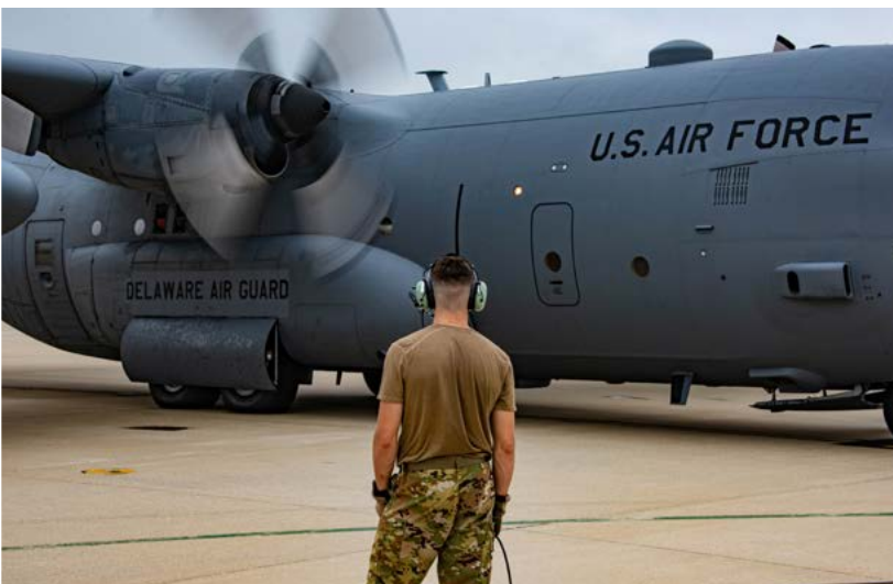
NEW CASTLE AIR NATIONAL GUARD BASE, Del – The first C-130H2.5 begins the engine start-up procedure before departing to Ramstein Air Base in Germany, 16-July-2022. Several units will spend approximately three weeks in Germany as part of a seasonal rotational force exercise.