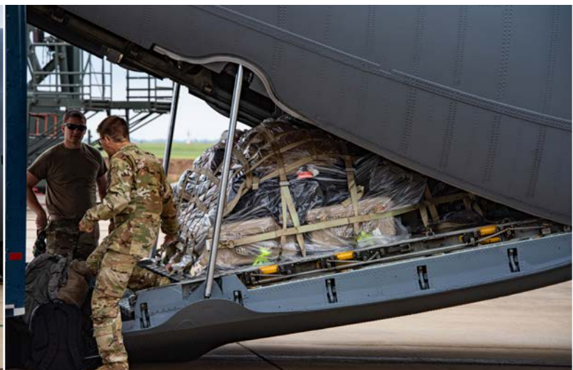
NEW CASTLE AIR NATIONAL GUARD BASE, Del – DANG loadmasters begin load a C-130H2.5 for chalk two for Exercise Silver Arrow, 16-July-2022. The second chalk departed approximately one hour behind the first. Both are bound for Ramstein Air Base in Germany.