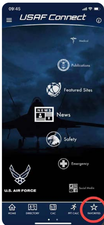
1. Tap on "FAVORITES"