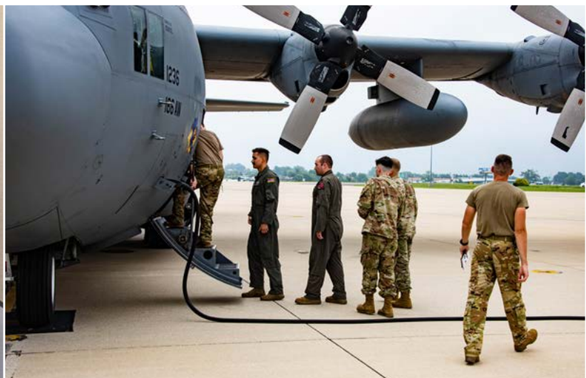
NEW CASTLE AIR NATIONAL GUARD BASE, Del – DANG Airmen board a C-130H2.5—the first of two chalks—for departure for Special Mission Silver Arrow, 16-July-2022. Several units will spend approximately three weeks in Germany as part of a seasonal rotational force exercise.