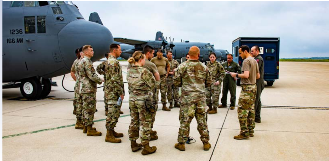
NEW CASTLE AIR NATIONAL GUARD BASE, Del – DANG Airmen receive a briefing prior to departure for Special Mission Silver Arrow, 16-July-2022. Several units will spend approximately three weeks in Germany as part of a seasonal rotational force exercise.

Delaware Air National Guard units plus up intra-theater airlift capability in Germany