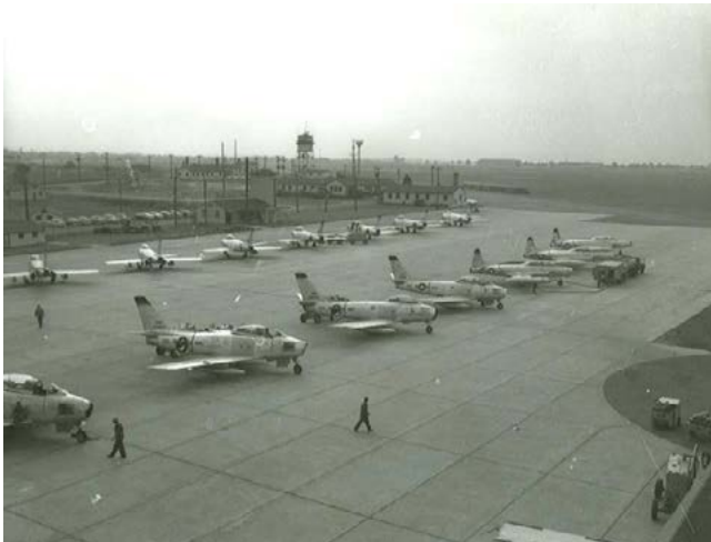
The DANG flight line in the early 1950's

From a WWII ferry base to a home for the DANG and general aviation